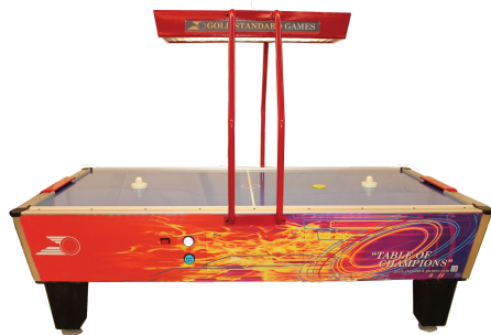
Gold Pro Elite w/ Overhead Scoring Unit