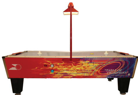
Gold Pro Plus w/ Compact Scoring Unit

99 1/2" L x 51 1/4" W x 72" H, Weight: 458 lbs