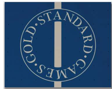
Faceoff Circle and Centerline for Tournament Play.