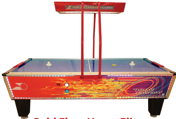
Gold Flare Home Elite w/ Overhead Scoring Unit