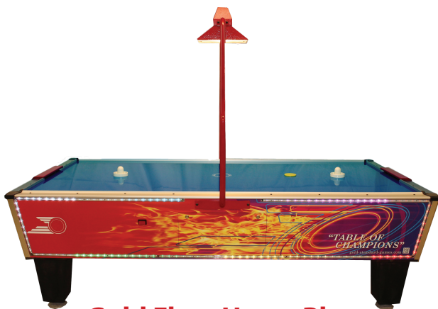
Gold Flare Home Plus w/ Compact Scoring Unit

Size: 99 1/2" L x 51 1/4" W x 72" H, Weight: 459 lbs