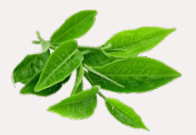
Green Tea Leaves

Recognised antioxidant benefits that delay signs of skin aging. Works well against sagging skin, sun damage, age spots, fine lines and wrinkles.