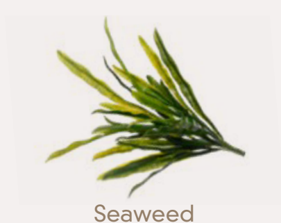
Used for its superior hydration and anti-aging properties. Effective against acnes, rosacea and various inflammatory symptoms.

Contains properties that prevents or reduce skin irritation, hyperpigmentation and inflammation.