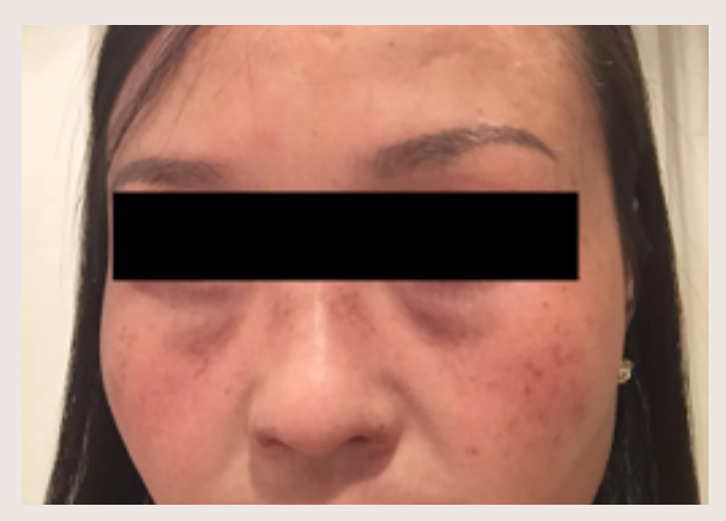
DIAGNOSIS: Developed hyperpigmentation after laser treatment