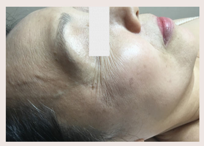
DIAGNOSIS: Wrinkle Formation / Dry Dull Skin / Pigmentation