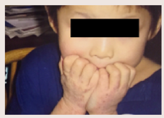
DIAGNOSIS: Eczema leads to scratching and bleeding