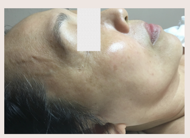
EFFECT: Reduction of Wrinkles / Brighter Complexion / Lightening of Pigmentation

RESULTS ACHIEVED IN: 1 Session (90 mins)