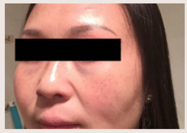
EFFECT: Visible lightening of hyperpigmentation

RESULTS ACHIEVED IN: 1 Month (Daily Usage)