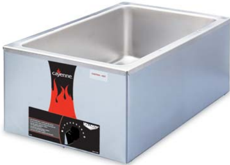
Cayenne® Model 2000 Warmer