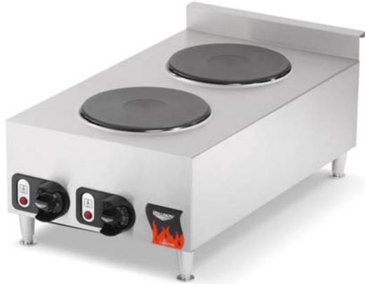
Cayenne® Electric Hot Plate