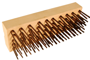
CC-1 Coarse Replacement Brush CM-1 Medium Replacement Brush