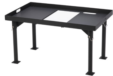
TB-36 Table Stand