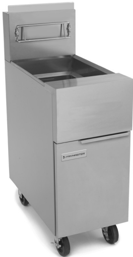
GF40 Shown with casters