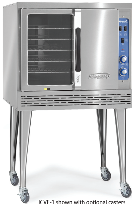
ICVE-1 shown with optional casters

Four bearings per door extend the life of the door mechanism.