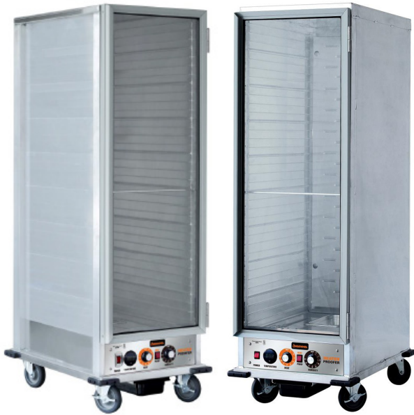
MODEL SHPN (NON-INSULATED)