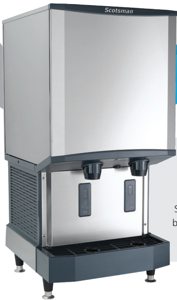
HID540A-1 with optional KLP24A legs