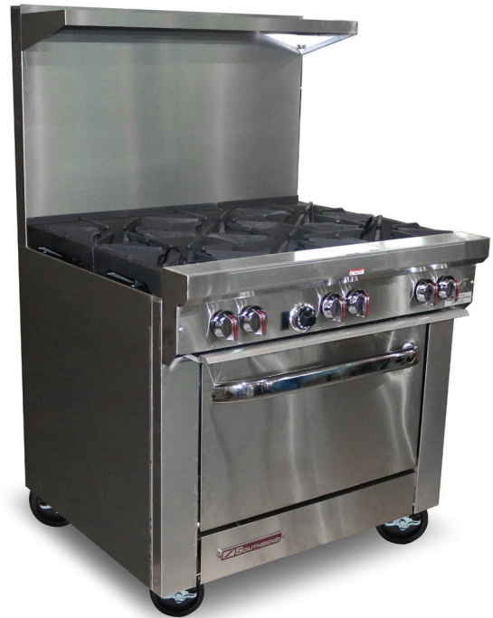
(S36D shown with optional casters)