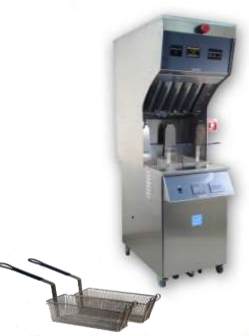
Two half Baskets