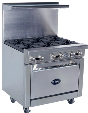
RR-6 with optional casters