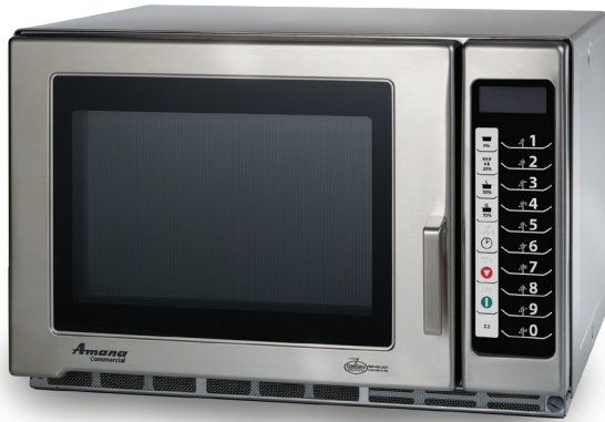
Model RFS12TS, RFS18TS, AFS518TS shown