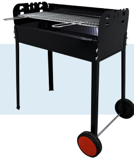
Painted Steel Charcoal BBQ Grill with Double Braiser & 2 Wheels