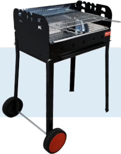
Painted Steel Charcoal BBQ Grill with Stainless Steel Brazier, Panel & 2 Wheels