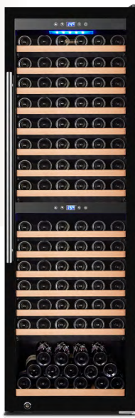
48258 27" Dual Zone