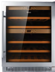
45260 23" Dual Zone