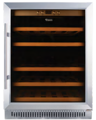
45261 23" Single Zone