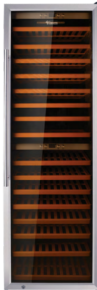
45258 27" Dual Zone