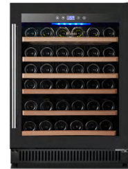
48261 23" Single Zone