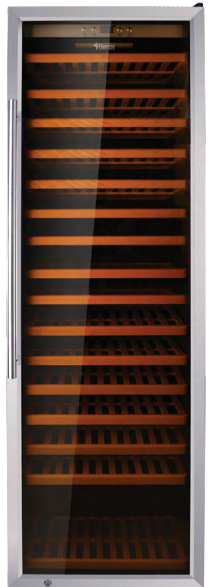
45259 27" Single Zone