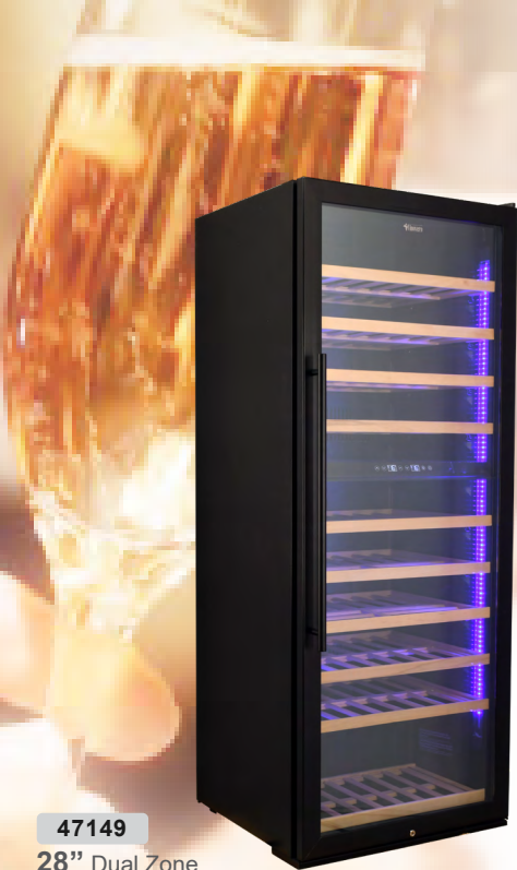
47149 28" Dual Zone