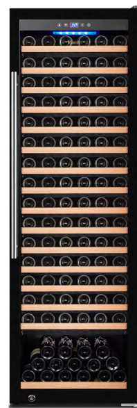
48259 27" Single Zone