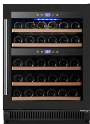
48260 23" Dual Zone