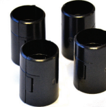
Black Abs Sleeves