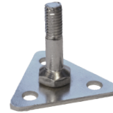
Foot Plate for Wire Shelving