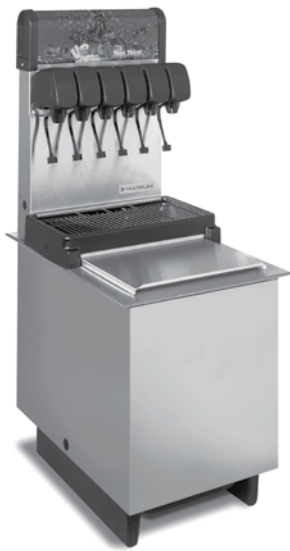
DI-1522-6-SL Shown with 464GP Valves