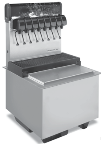
DI-2323-8-SL Shown with 464GP Valves

Flex Manifold relocated to tower for easy access