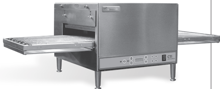
Shown with 50" (1270 mm) extended conveyor.