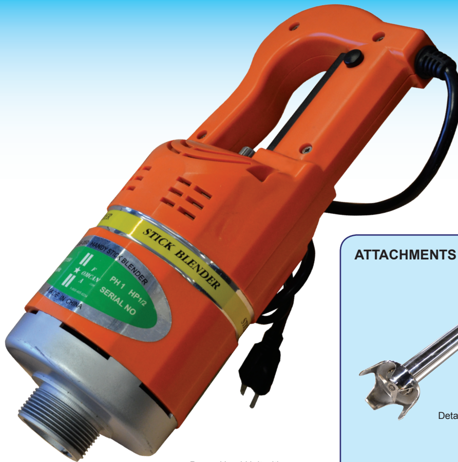
Power Head Unit with Variable Speed Control

Our immersion blenders are designed to provide reliability and durability for professional kitchens. It spins up to 11500 RPM and is capable of mixing, blending, and grinding at high speed. Capable of handling as much as 100 QT. Made in China.