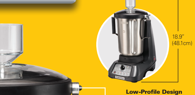
for improved ergonomics