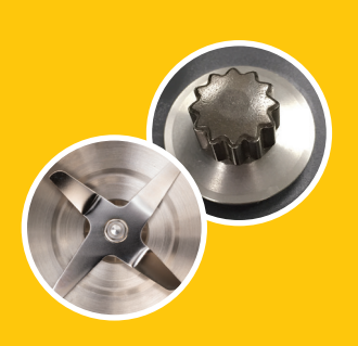
Lifetime Warranty on Motor Drive Coupling and Stainless Steel Blades