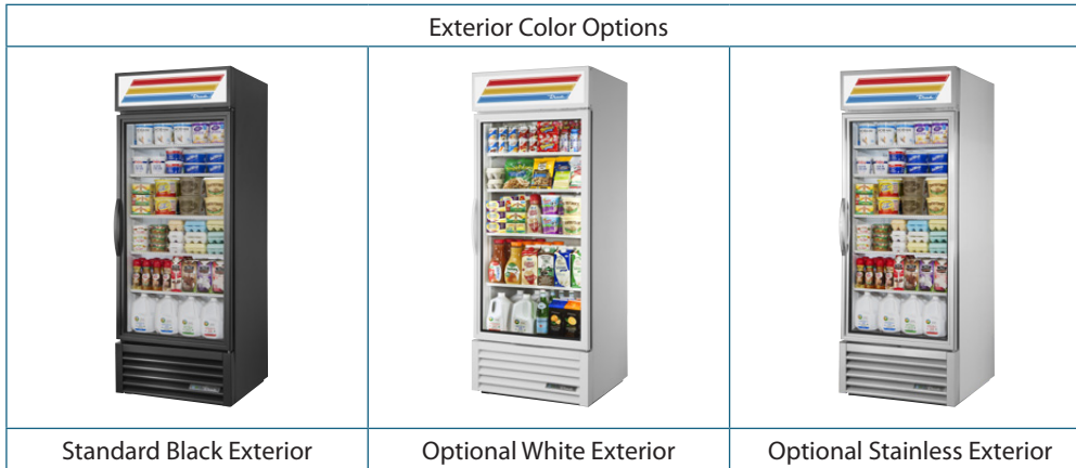
Standard Black Exterior