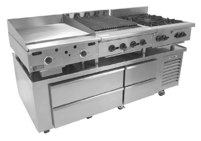
Model ARS72 (Shown with optional right-located compressor with ASA griddle, ACB charbroiler and AHP hotplate)