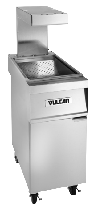
Frymate VX15 shown with optional ThermoGlo<sup>™</sup> Food Warmer