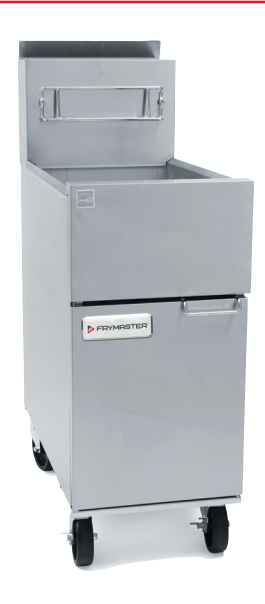
ESG35T Shown with optional casters