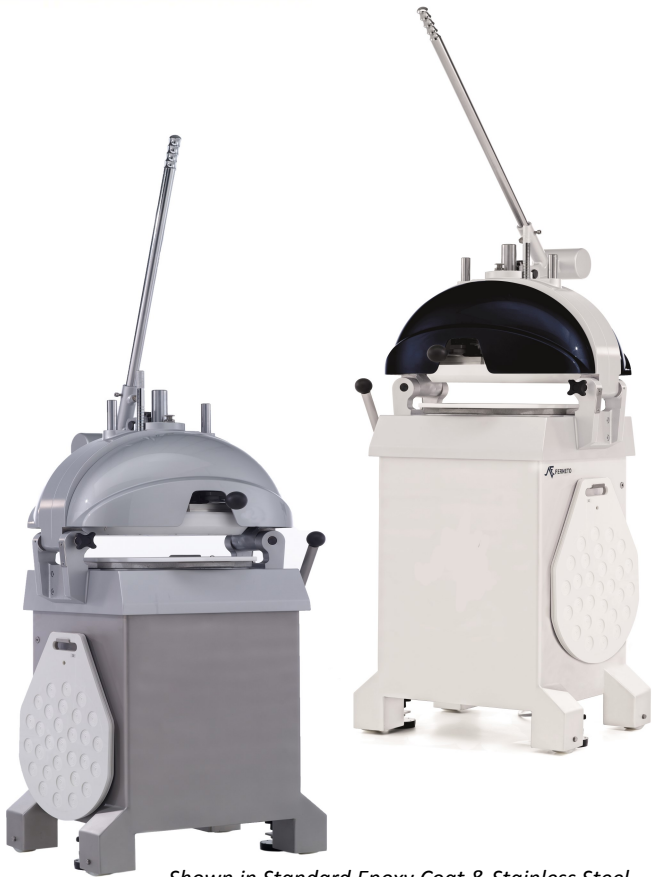
Shown in Standard Epoxy Coat & Stainless Steel