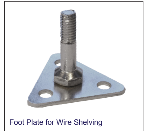
Foot Plate for Wire Shelving