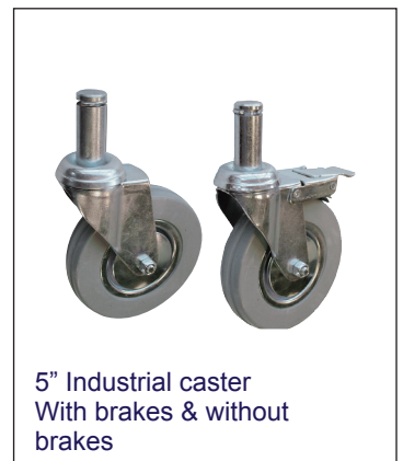
5" Industrial caster With brakes & without brakes