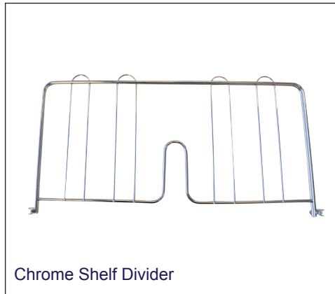
Chrome Shelf Divider