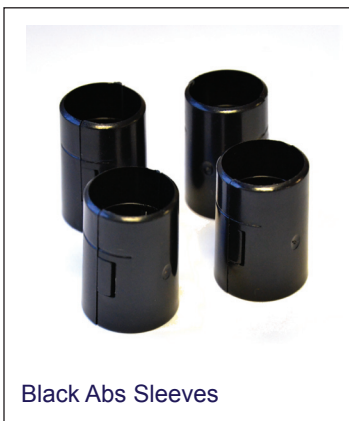
Black Abs Sleeves