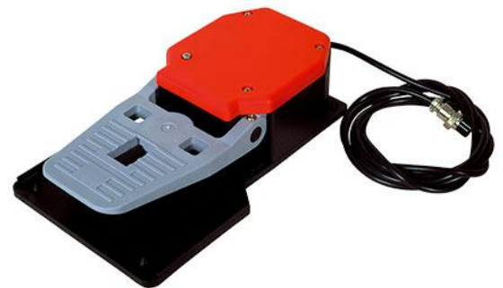
Optional Accessory: On / Off foot control pedal

** Due to continuous product improvement, specifications are subject to change without notice.