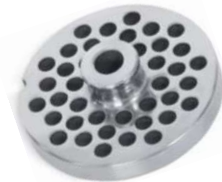
3 Plates Included (5mm, 8mm & 10mm) Additional Accessories Available Upon Request

** Due to continuous product improvement, specifications are subject to change without notice.