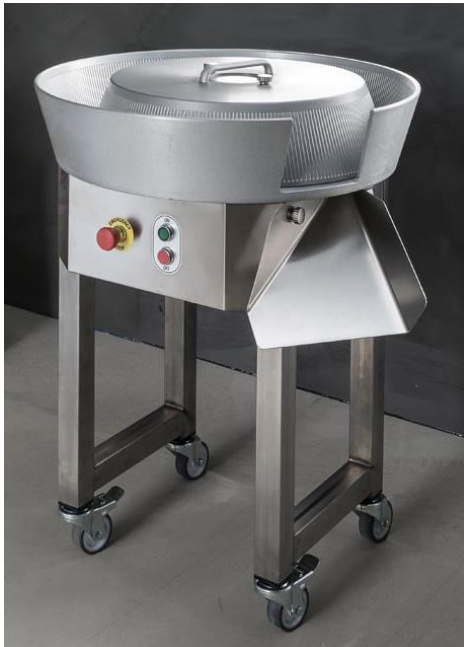
Available by special order with legs and castors, Model BMDBR3L