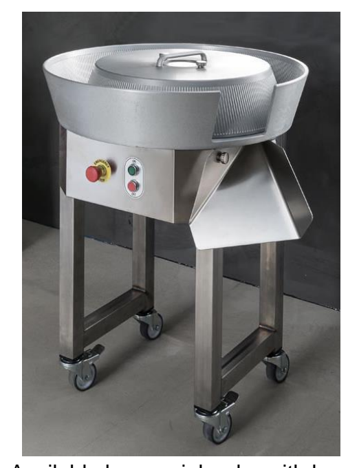
Available by special order with legs and castors, Model BMDBR3L

** Due to continuous product improvement, specifications are subject to change without notice.