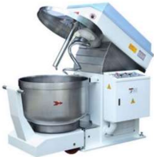
Mixing Head Raised View

** Due to continuous product improvement, specifications are subject to change without notice.