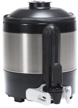
TF SERVER, 1G MECH NOBASE GEN3