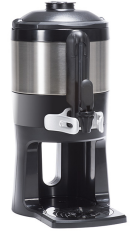
TF SERVER, 1G MECH GEN3