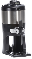
TF SERVER, 1G DSG GEN3