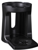
STAND ASSY, TF SERVER GEN3