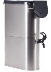
TDO-N-3.5,RSVR W/ PINCHTUBE/BREW THRU LID