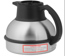
THERMAL CARAFE, BLK 1.9L 1PK