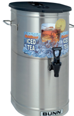
TDO-4, RESERVOIR BREW THRU