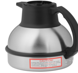
THERMAL CARAFE, BLK 1.9L 12PK