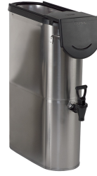
TDO-N-3.5, W/BREW THRU LID