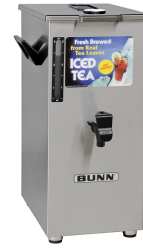
TD4T, W/BREW THRU LID & LIFT HANDLE