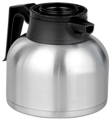
CARAFE,SST 1.9L SHRT BLK 12/