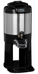
TF SERVER, DSG2 1.5G CD