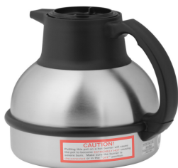
THERMAL CARAFE, ORN 1.9L 12PK