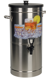
TDS-3.5, 3.5 GAL