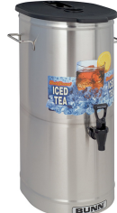
TDO-5, RESERVOIR, BREW THRU