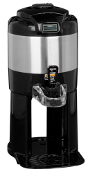
TF SERVER, DSG2 1G CD