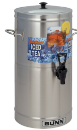
TDS-3, 3 GAL