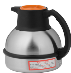
THERMAL CARAFE, ORN 1.9L 1PK