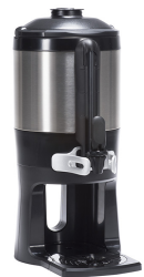
TF SERVER, 1.5G MECH GEN3