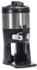
TF SERVER, 1G DSG GEN3