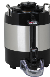
TF SERVER, 1G/3.8L MECH NOBASE