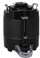
TF SERVER, 1G/3.8L MECH BLK NOBASE