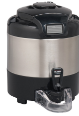
TF SERVER, DSG2 1G SST NOBASE