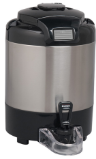
TF SERVER, DSG2 1.5G SST NOBAS