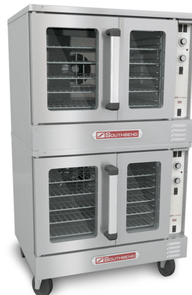
(shown with optional casters)

140°F to 500°F solid state thermostat and 60 minute mechanical cook timer.