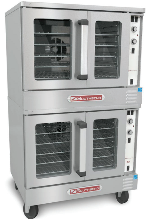
(BES/27SC shown with optional casters)

140°F to 500°F solid state thermostat and 60 minute mechanical cook timer.