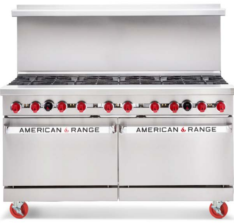
Model AR-I0 Shown with optional stand & casters.

The Heavy Duty Restaurant Range Series by American Range was designed for continuous rugged use and performance. All the latest technology is incorporated to give you the best value for your money.