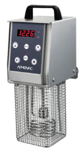
SOFTCOOKER 230 MADE IN ITALY