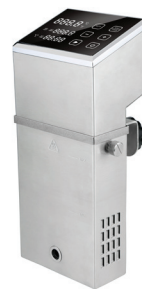
SV-310 MADE IN CHINA