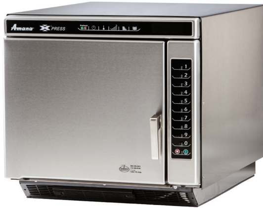
Model ACE14N shown