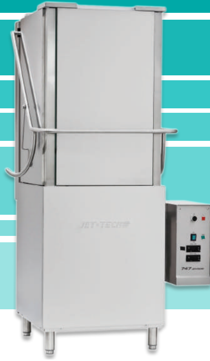
IDEAL FOR RETAIL & IN-STORE BAKERIES, DELIS, C-STORES, SCHOOL AND PIZZERIAS