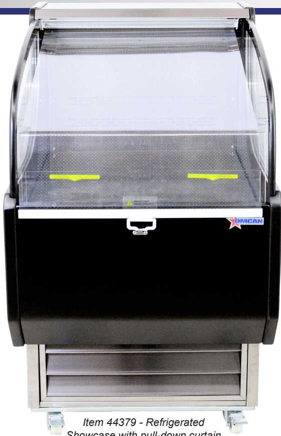
Item 44379 - Refrigerated Showcase with pull-down curtain