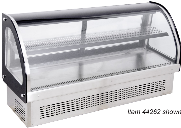
Item 44262 shown