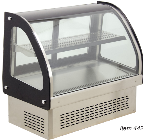
Item 44260 shown