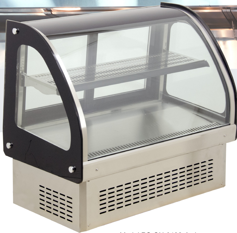
Model RS-CN-0128-A shown

ATTRACTIVELY DISPLAY FOOD MERCHANDISE AND INCREASE IMPULSE SALE