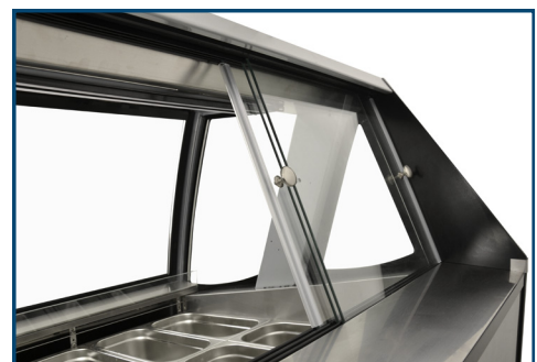
Efficient sliding door at the back for easy access