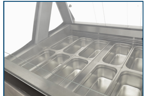
Comes with 12 Quarter-size Pans