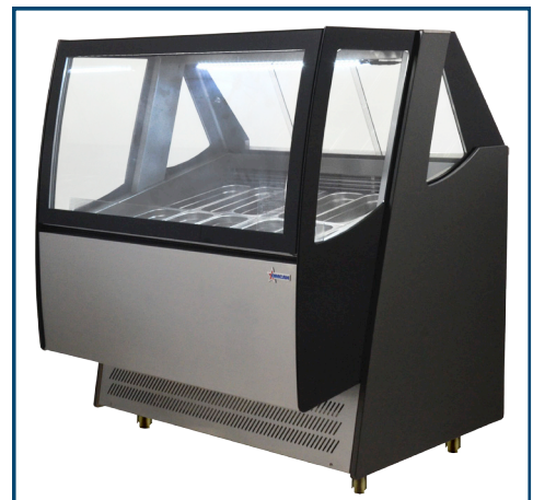
Ice Cream Display with Lights On • 2 LED Lights (6 Watts each)