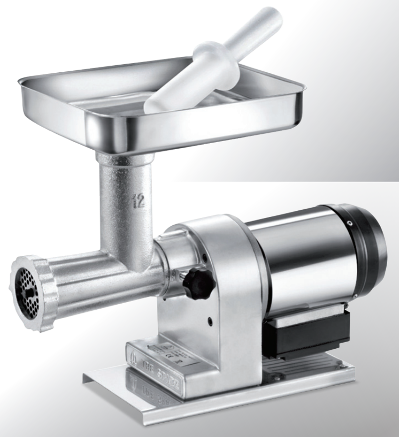
Item may not be exactly as shown

This grinder offers quality at an economical price. It comes with 3/16 plate and a knife. Ideal for home use.